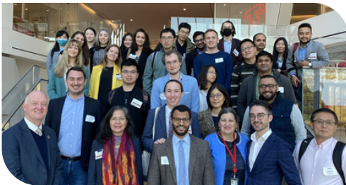
PhD research day, November 2022