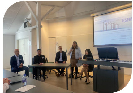
GSEM Conference In Copenhagen, October 2023